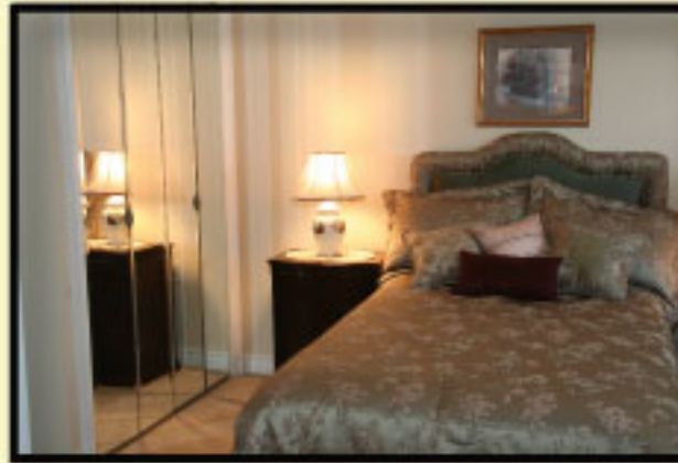
Mirrored Closets, French Doors, Quality Broadloom, Italian Ceramics

Orillia Independent Living is ideal for those who want complete freedom of choice in their Retirement Lifestyle. Carefully designed to blend all the freedoms of hotel style living with complete security, this setting is perfect for those who are looking for peace of mind. Richly appointed and professionally decorated, this new four story elevator building was built with Seniors in mind.